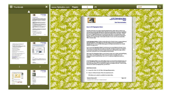
Released: February 2011

For Example, select "Thumbnails": Initial Show Thumbnails ▼ Then you will get flipbook shown with below initial interface: